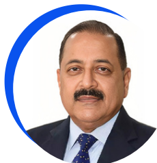
Dr. Jitendra Singh Hon'ble Minister of State (i/c) for Science and Technology