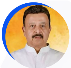
Shri Rao Narbir Singh Hon'ble Minister for Industries & Commerce, Environment, Forest and Wild Life, Foreign Cooperation, Sainik & Ardh Sainik Welfare Govt. of Haryana