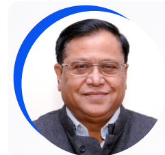
Dr. V. K. Saraswat Member of NITI Aayog, and Chancellor, Jawaharlal Nehru University