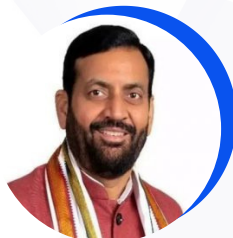
Shri Nayab Singh Saini Hon'ble Chief Minister, Haryana