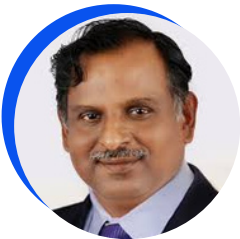
Dr. V. Narayanan Secretary, DoS Chairman ISRO